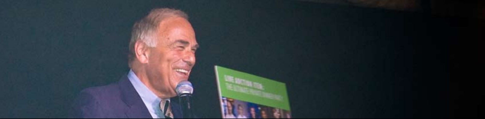
FEASTIVAL 2011: SEPTEMBER 14, 2011